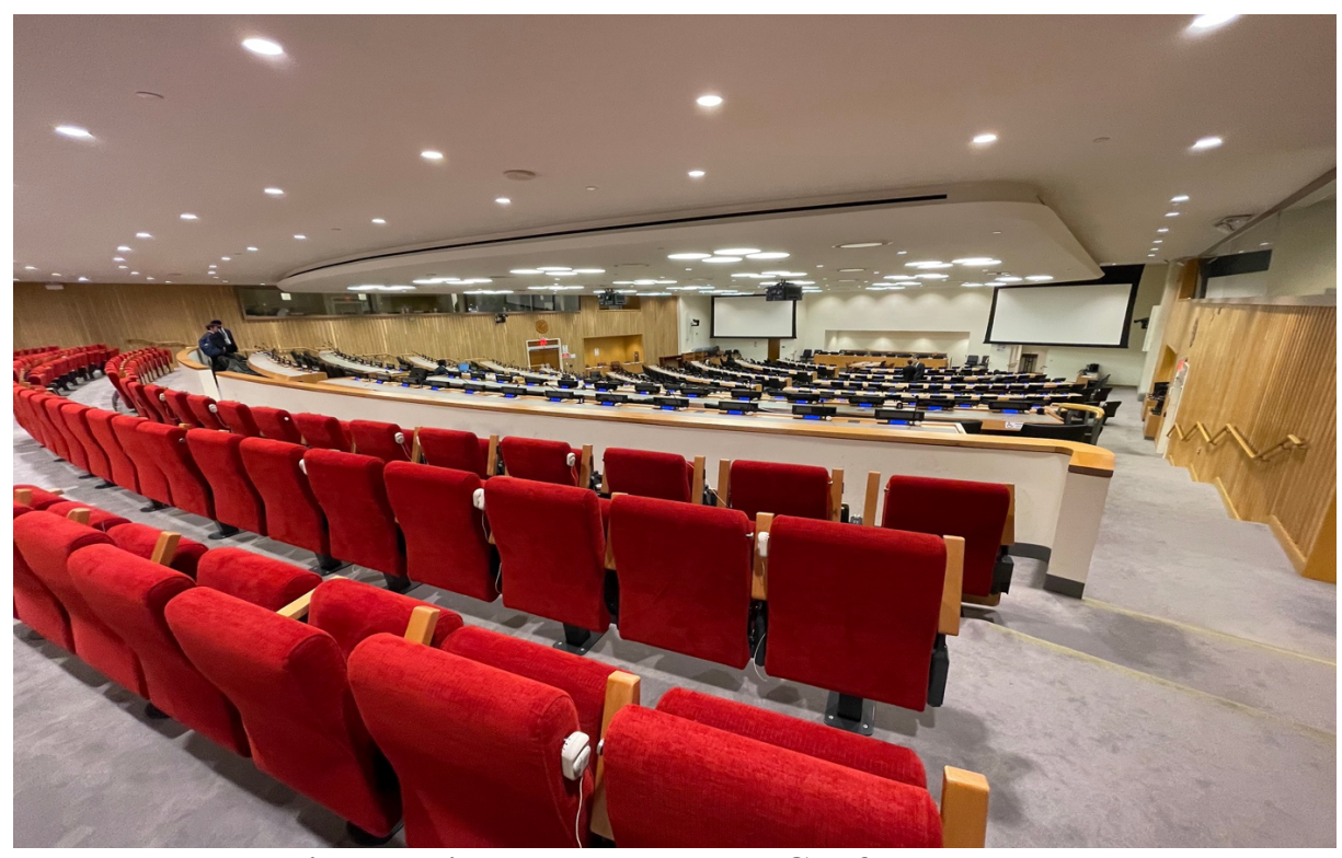
United Nations Headquarters Conference Room