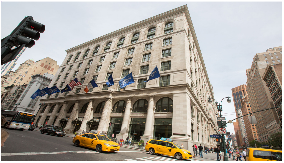
City University of New York Graduate Center, Fifth Avenue